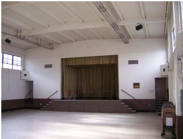
Figure 2 Interior of RWPRD Facility

In the past, the RWPRPD has rented its multi-purpose building for a range of classes, events, parties and other celebrations. There have been very few paid rentals in 2016; the District reported there were more non-paying events than paid events, which often did not adequately cover the costs for cleanup. 5