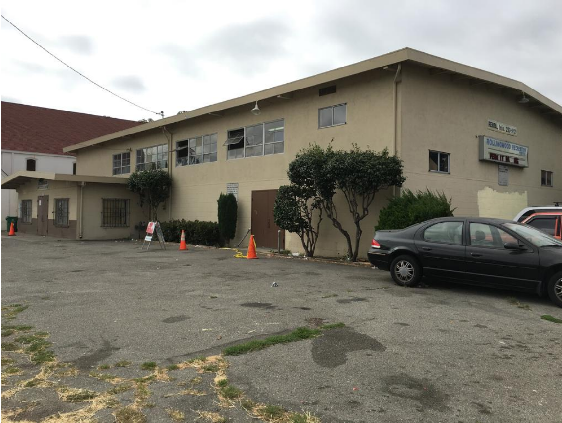
Figure 3 Exterior of RWPRD Facility